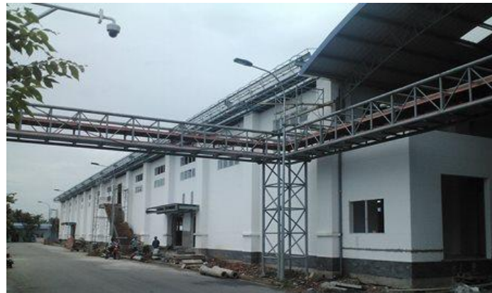
Betalactam New plant on 31/07/2014

Leveling the rest: has already constructed and basically completed. The embankment bordering Ba Lang river: procedures of direct contracting for survey and design are performing, expected to be completed on Apr 2015.